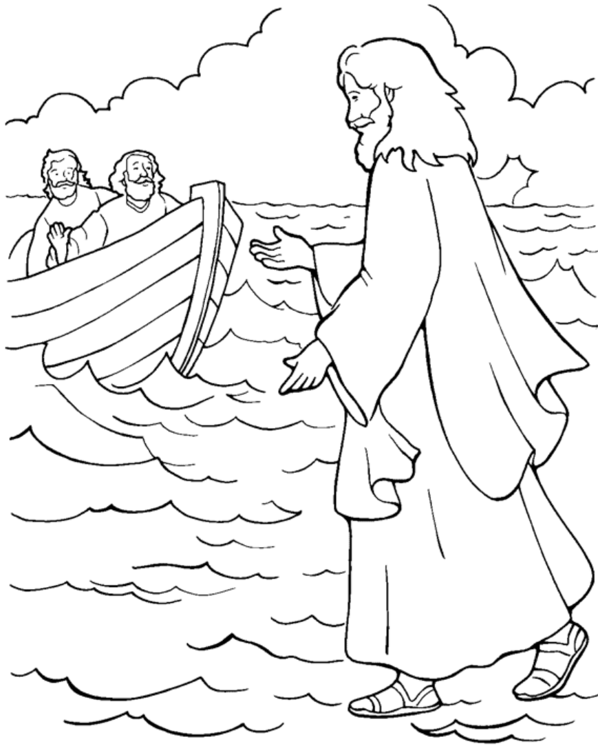
Jesus Walks on Water

From Thru-the-Bible Coloring Pages for Ages 4-8. © 1986, 1988 Standard Publishing. Used by permission. Reproducible Coloring Books may be purchased from Standard Publishing, www.standardpub.com, 1-800-543-1301.